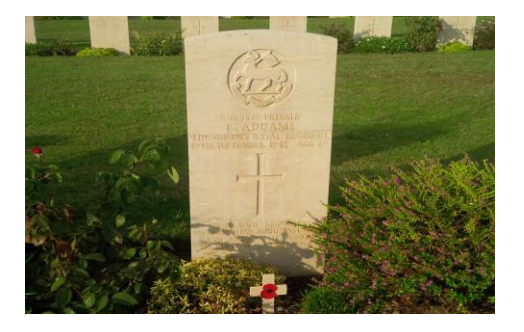
Pte Addams - Queens Royal Regiment - Salerno War Cemetery