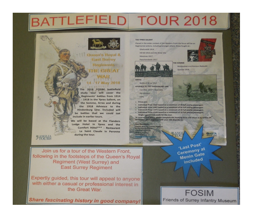
Vel Exuviae Triumphans

Finally I am eagerly anticipating the upcoming Battlefield Tour in May: it is currently fully subscribed with a waiting list. Most of the people who came on the 2016 tour will be on the coach and I am looking forward to another fascinating trip in friendly and knowledgeable company.