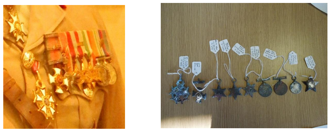
Orders and decorations of Major-General Whitfield: on display before the fire and prepared for restoration.

We returned from Walsall with a number of boxes of items recovered from selected areas of the Museum of particular interest including the ' Colonels of the Regiment ' cabinet, in the north-west corner of the Onslow Room and the main medal display wall. Volunteers have been concentrating on cleaning, identifying and cataloguing medals over the last few months: those bearing the recipient's name have been prioritised for restoration. Medals without a name inscribed have been set aside: those that are intact or slightly damaged will be cleaned and re-used to make up complete medal groups.