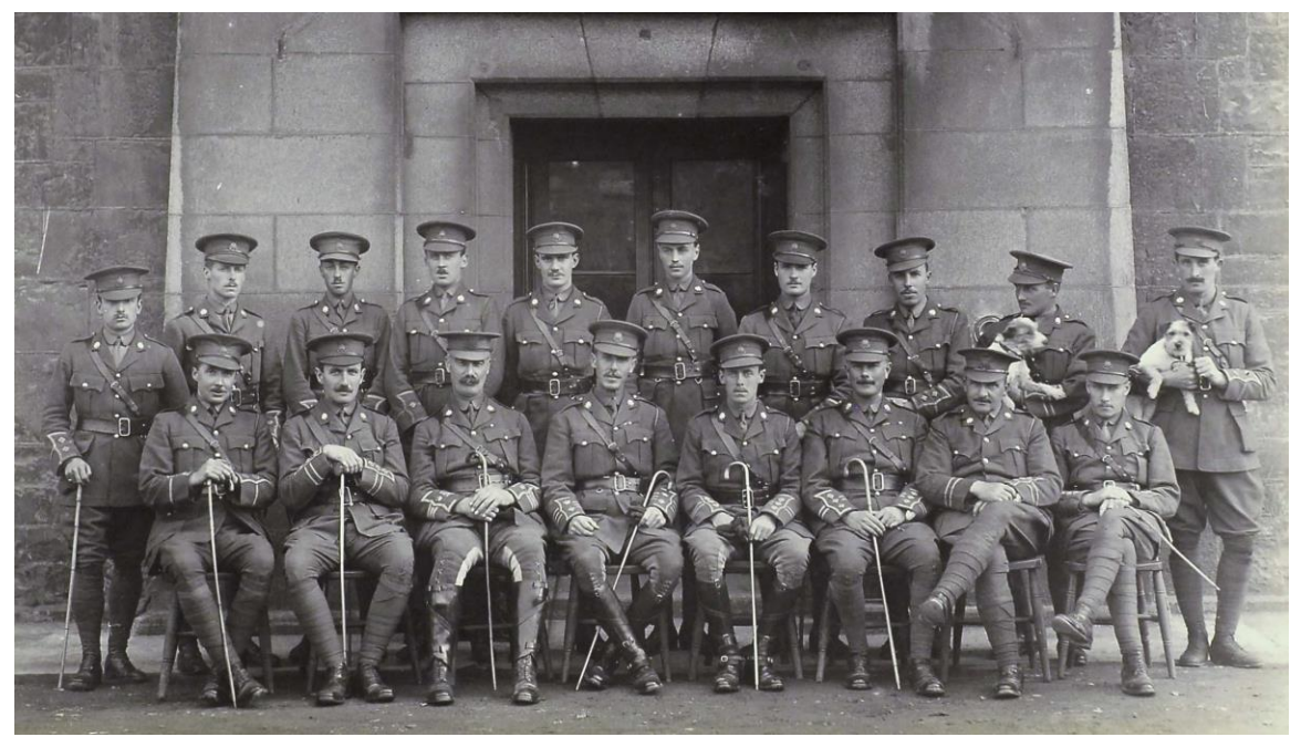
Officers of the East Surrey Regiment

In April I am talking to the Royal St. Georges Society on regimental history then in May we are off to France and Belgium on the FOSIM Battlefield Tour. This starts in Mons where the 1<sup>st</sup> Battalion the East Surrey Regiment was soon in action on the canal, after then we follow the retreat south toward Paris to the Marne.